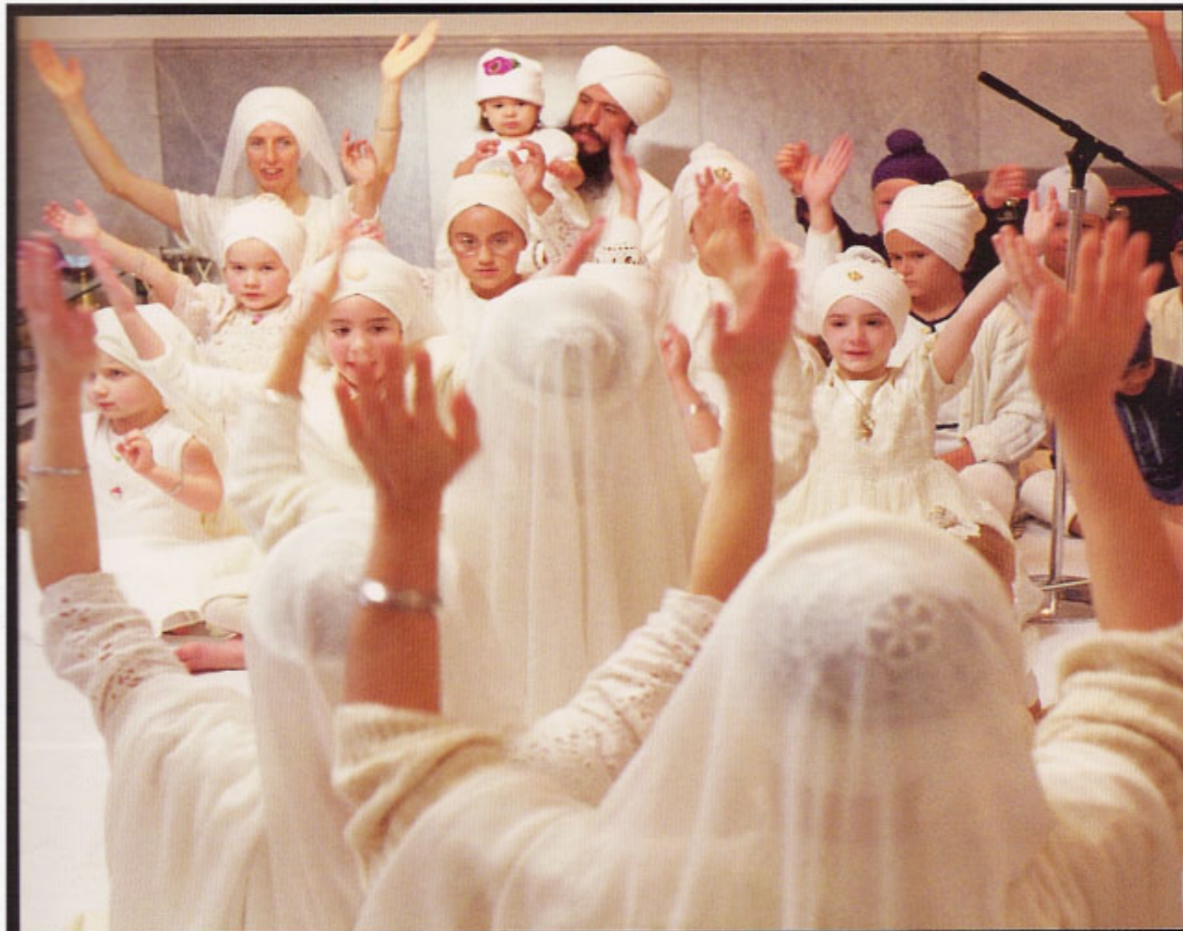
1 Pauri means stair, i.e., the first few stanzas of the Guru Granth Sahib.