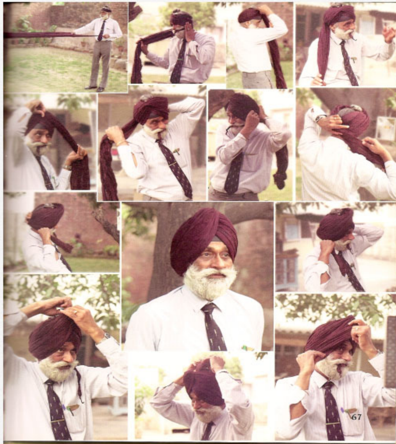
Tying a Dastaar (Sikh Turban)